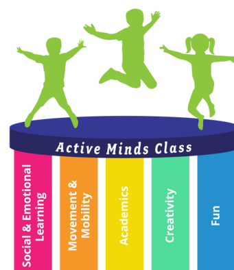
AMC 5 PILLARS OF DEVELOPMENT